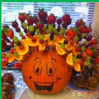
Strong-Huttig School District