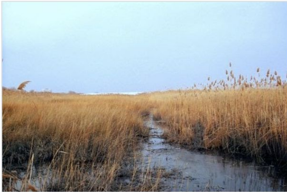
The Meadowlands in New Jersey