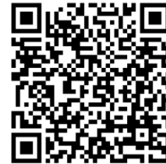
ADE Launches Transportation Modernization Grant Program

More information will be shared during January 7th call