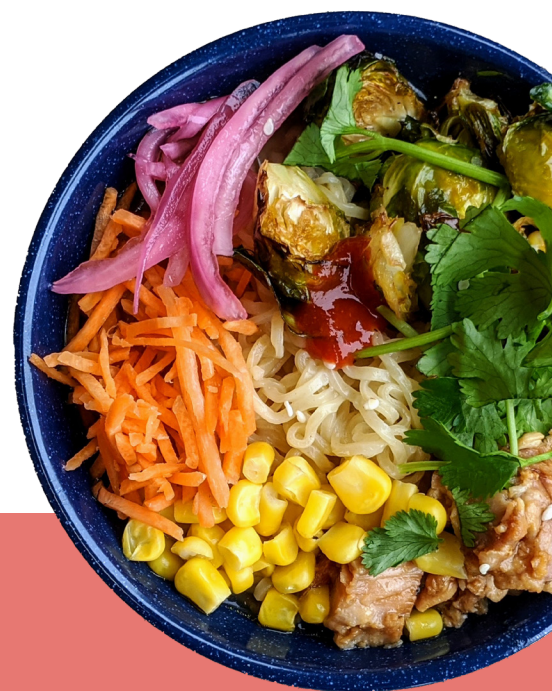
RAMEN BOWL WITH CHICKEN

Arkansas School District, Aramark Student Nutrition partner